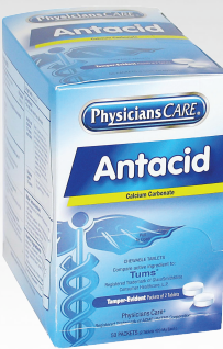
ANTACID TABLETS 100CT