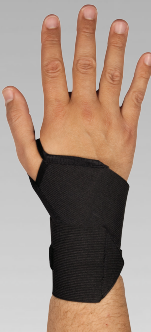
WRIST & ELBOW SUPPORTS