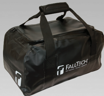
FALL PROTECTION GEAR BAGS