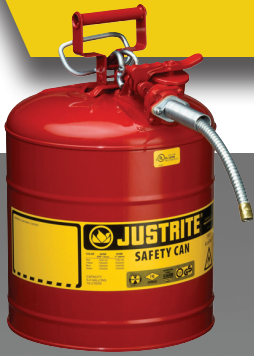
5/8IN HS, T2, 5G RED SAFETY CAN