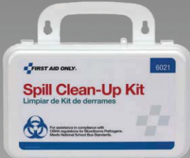
BBP SPILL CLEAN UP KITS