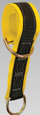
WEB PASS THROUGH W/ ANCHOR STRAPS