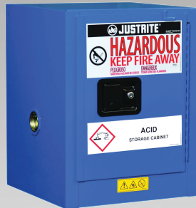
4 GALLON SELF CLOSING BLUE HAZARDOUS COUNTERTOP