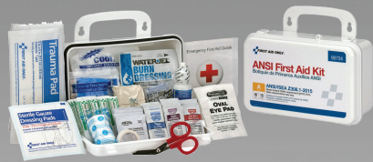
10 PERSON FIRST AID KIT ANSI A