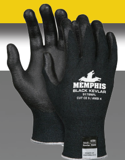
GENERAL PURPOSE GLOVES