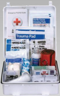
50 PERSON FIRST AID KIT ANSI B