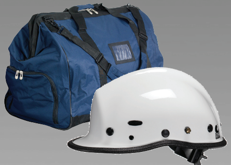
GEAR BAGS & RESCUE HELMETS