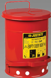
OWC W/FOOT COVER, 6G, RED CAN