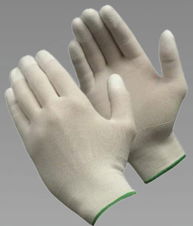
CRITICAL ENVIRONMENT GLOVES