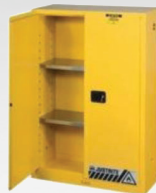
JUSTRITE 45 GALLON CABINET