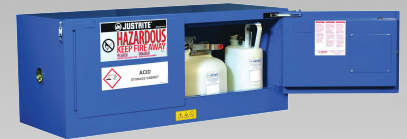
12 GALLON SELF CLOSING BLUE HAZARDOUS PIGGYBACK