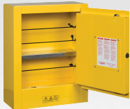
SURE-GRIP® EX MINI FLAMMABLE SAFETY CABINET TRANSPORTABLE