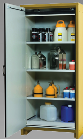
30 GALLON CABINET