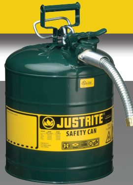
1IN HOSE, T2, 5G GRN SAFETY CAN