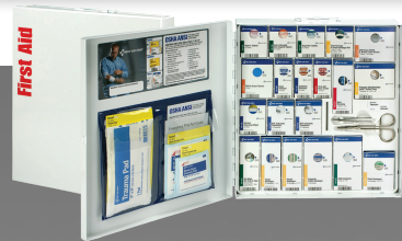
LARGE SMART COMPLIANCE FIRST AID KIT