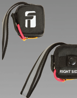
SUSPENSION TRAMA SYSTEMS