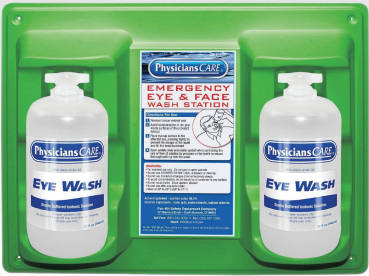
32OZ CAPACITY DOUBLE EYEWASH STATION