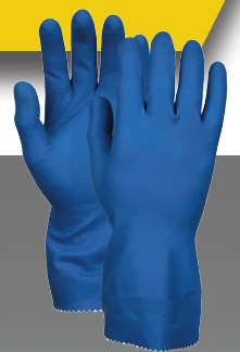
CHEMICAL RESISTANT GLOVES