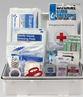
25 PERSON FIRST AID KIT ANSI A