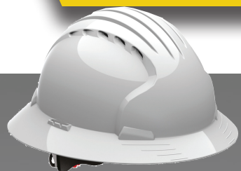
TYPE I HARD HATS