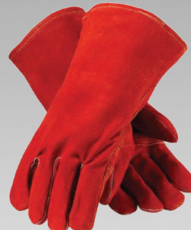
HEAT PROTECTION GLOVES