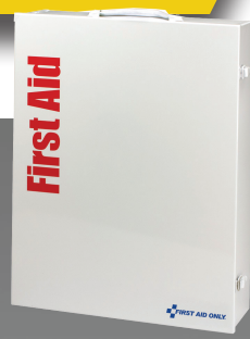
XL SMART COMPLIANCE FIRST AID CABINET