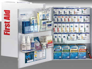
XL SMART COMPLIANCE FIRST AID KIT