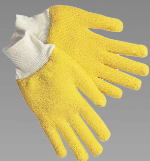
HIGH PERFORMANCE GLOVES