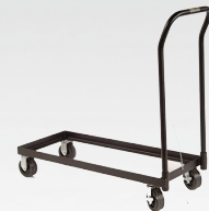
CABINET ROLLING CART