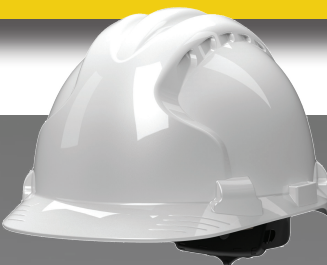
TYPE II HARD HATS