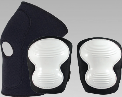
KNEE PADS & SUPPORTS