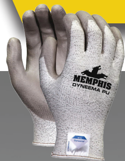
CUT RESISTANT GLOVES