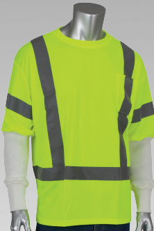
DUO-PRO™ SHIRT W/ INTEGRATED SLEEVES