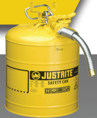
1IN HOSE, T2, 5G YEL SAFETY CAN