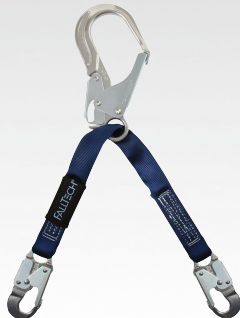
ALUMINUM REBAR HOOKS