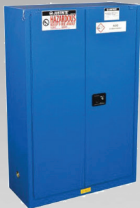
45 GALLON CABINET BLUE HAZARDOUS CHEMCOR®