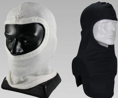
FLAME & FIRE RESISTANT HOODS