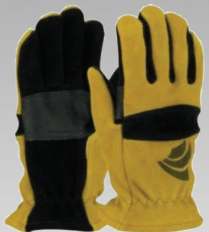
EMERGENCY RESPONDER GLOVES