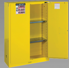
45 GALLON CABINET SELF CLOSING CABINET