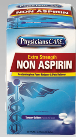
EXTRA STRENGTH NON-ASPIRIN 100CT