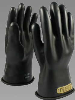
RUBBER INSULATING GLOVES & SLEEVES