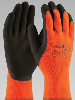
COLD PROTECTION GLOVES