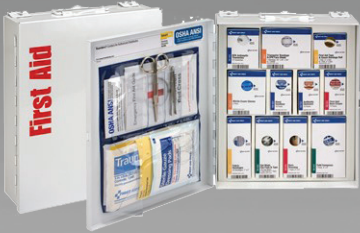
MEDIUM METAL SMARTCOMPLIANCE CABINET, AN