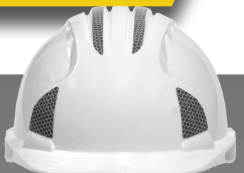
HARD HAT ACCESSORIES