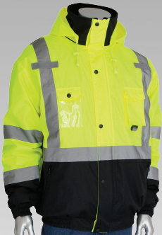
HI-VIS JACKETS & COATS